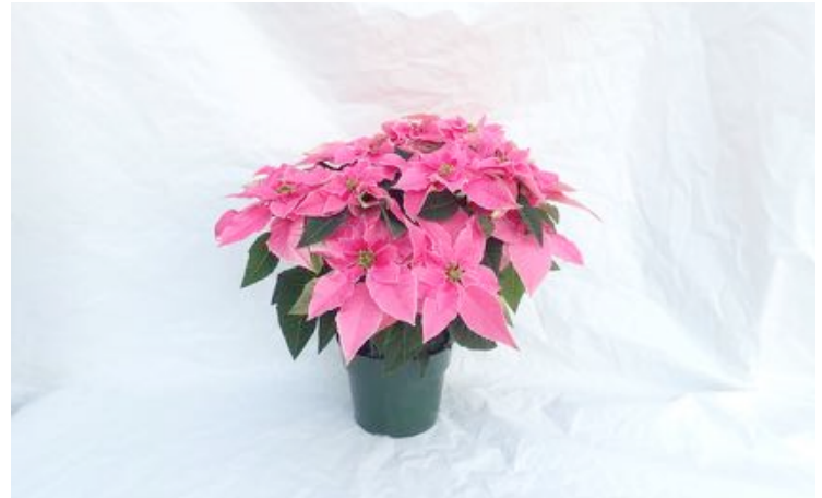
Princettia Hot Pink