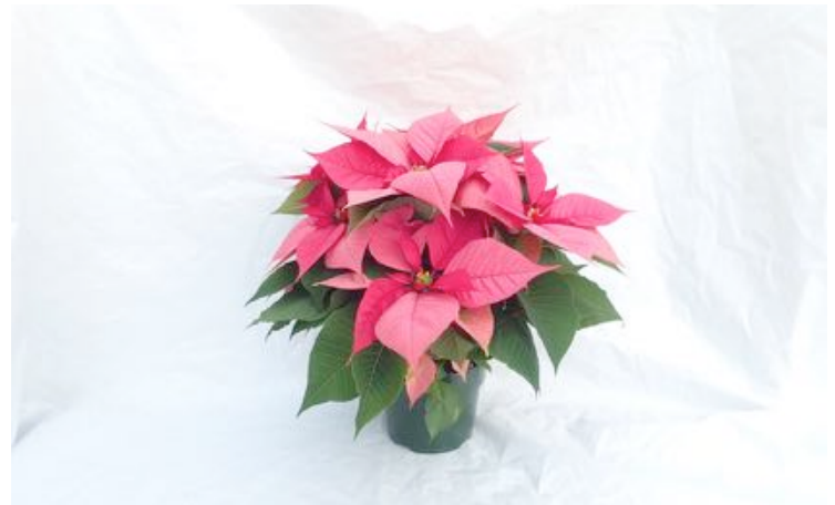
Christmas Glory Pink

Selecta/Ball Horticulture had five pink cultivars in the trials. Christmas Lights Pink was highlighted by growers as a cultivar of interest.