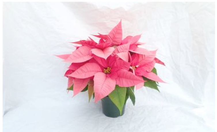
Christmas Joy Pink