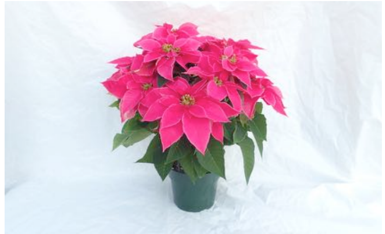
Princettia Pink Queen