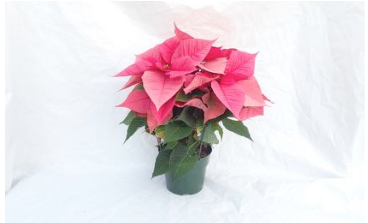
Christmas Feelings Pink

Selecta/Ball Horticulture had five pink cultivars in the trials. Christmas Lights Pink was highlighted by growers as a cultivar of interest.