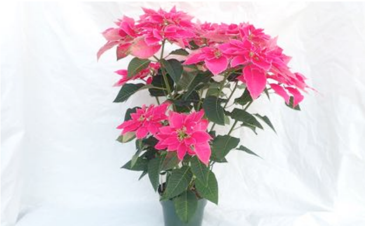
Luv U Pink