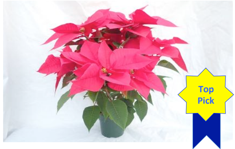
EK 1584 Pink Experimental

Eight pink entrees were submitted by Dümmen Orange. Princettia Pink and EK 1584 Pink Experimental were highlighted by growers.