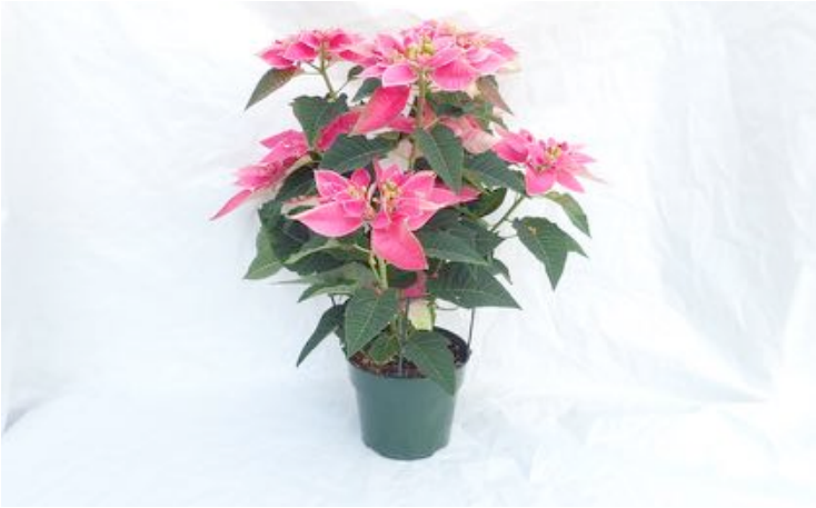
J'Adore Hot Pink