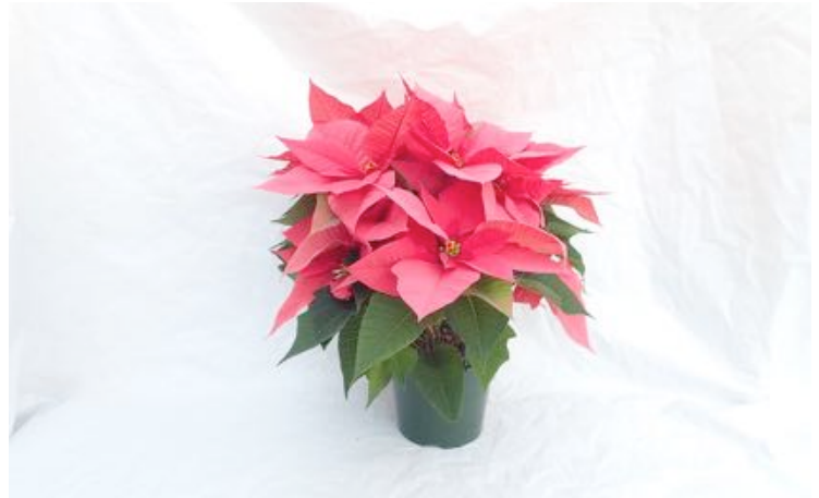
Christmas Wish Pink