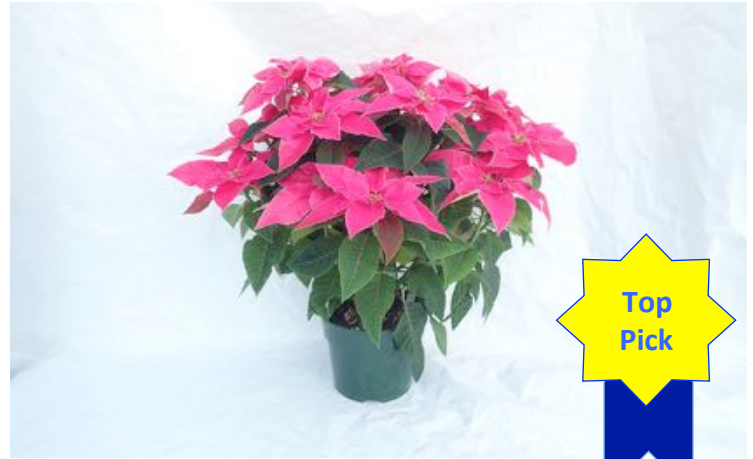
Princettia Dark Pink

Suntory submitted their Princettia line of poinsettias to the trial. The compact growth of Princettia series makes them well suited for smaller sized pots.