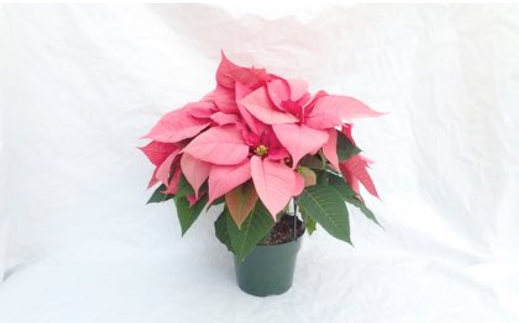
Premium Lipstick Pink