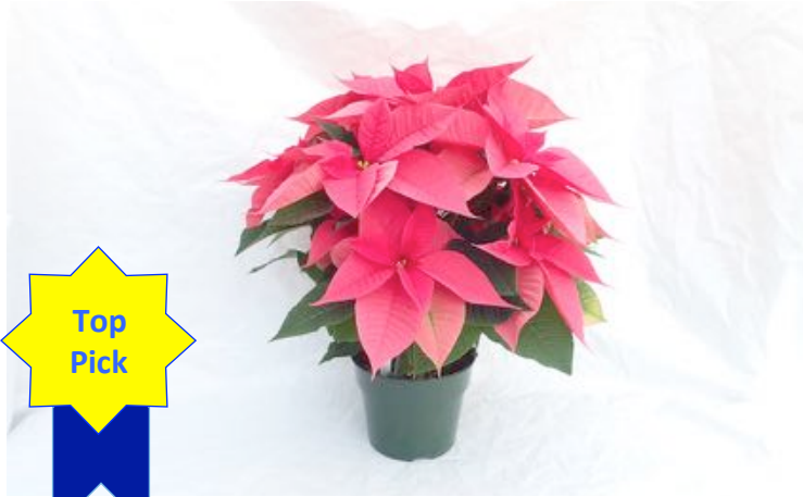
Christmas Lights Pink