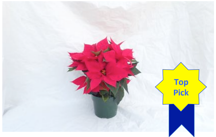
Carina Hot Pink

Syngenta had two pink cultivars in the trials. Growers highlighted Carina Hot Pink as a top selection.