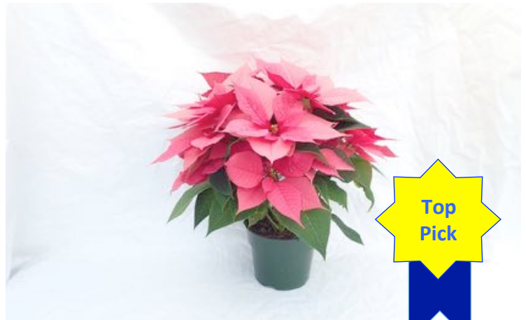
PON 64 Pink Experimental

Beekenkamp included one pink experimental cultivar in the trials. PON 64 had a strong pink coloration.