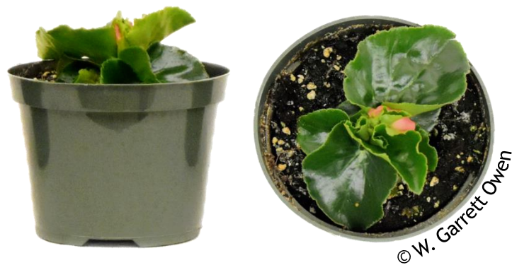
Figure 1. Fibrous begonias ( Begonia × semperflorens-cultorum ) exhibiting hardened, stunted growth with dark green leaves as a response from an accidental drench application of 3 ppm (0.0125% mg active ingredient per pot) of paclobutrazol.