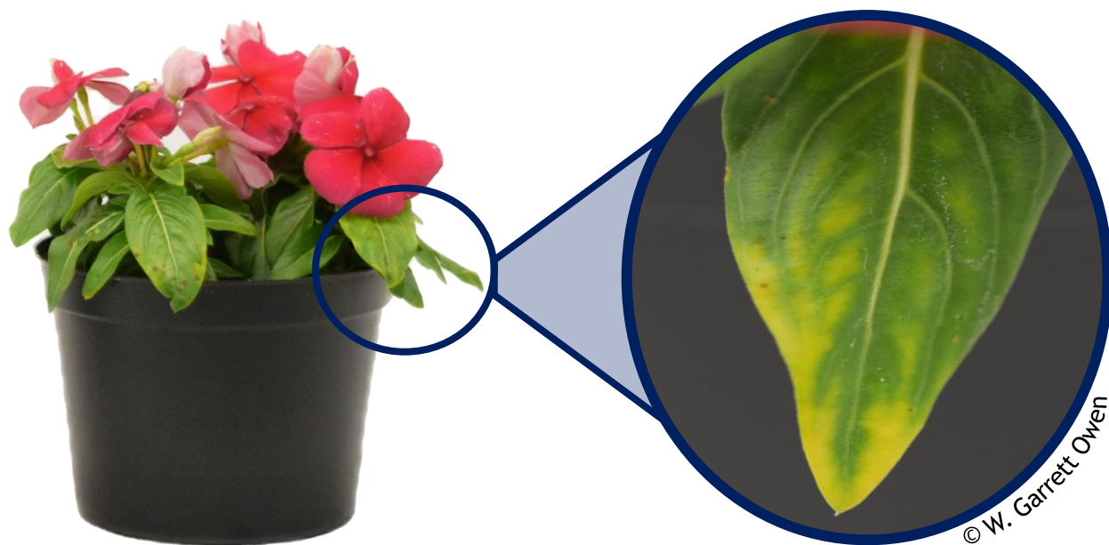
Figure 4. Stunted vinca ( Catharanthus roseus ) plants exhibiting chlorosis to interveinal chlorosis (yellowing). Photos were taken of plants that were accidentally drenched with 3 ppm (0.0125 mg active ingredient per pot) paclobutrazol.