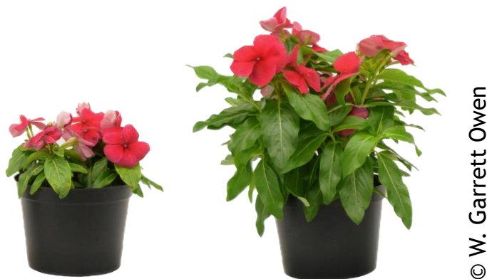
Figure 3. Vinca ( Catharanthus roseus ) exhibiting stunted plant growth (left) compared to a 'normal' plant (right) taken from the crop that was not accidentally drenched with 3 ppm (0.0125 mg active ingredient per pot) paclobutrazol.