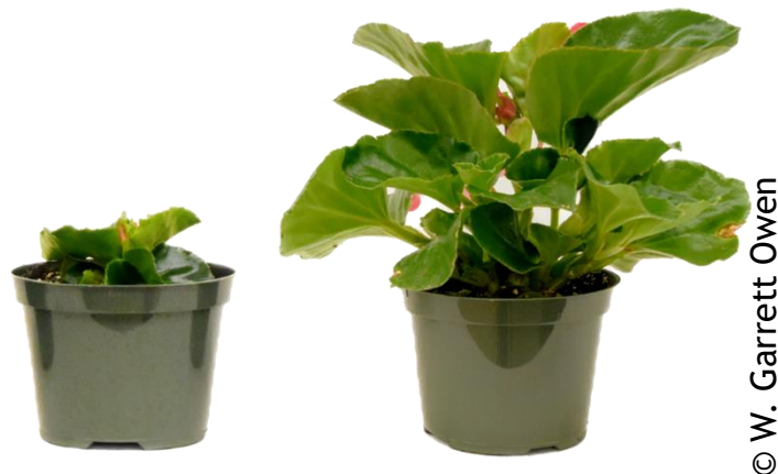
Figure 2. Comparison of symptomatic (left) and asymptomatic (right) fibrous begonias ( Begonia × semperflorens-cultorum ) that either received an accidental drench application of 3 ppm (0.0125 mg active ingredient per pot) of paclobutrazol or no drench.