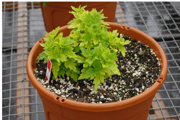
Chlorosis in the mum crop was linked to a malfunctioning fertilizer injector.

Controlled Release Fertilizers (CRF) are frequently utilized by garden mum growers with great success. However, in some cases growers either over apply the fertilizer (exceeding label recommendations) or mistakenly concentrate all of the slow release fertilizer onto one side of the container. In the photograph to the right the CRF fertilizer is concentrated in one spot directly across from the emitter. As a