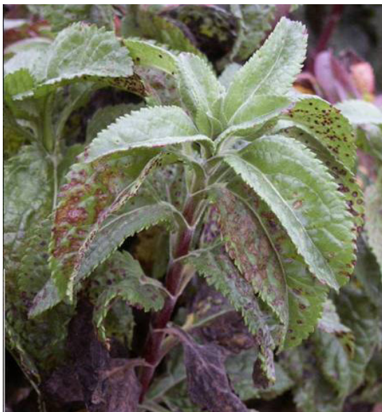
Figure 2. Browning of leaf tissue from Veronica rust.

Various species of Veronica ( V. longifolia , V. Montana and V. spicata ) can serve as hosts for rust pathogens. The symptoms of Veronica rust are: red-brown rust pustules on the undersides of leaves, browning of leaf tissue, and plant decline (Fig. 2, 3). Plants are most susceptible to