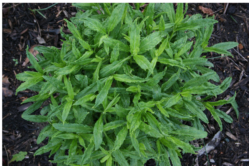
Figure 5. Blotchy, irregular foliage on Veronica from CMV.

CMV is a common virus in ornamental plants and has a very wide host range, including many vegetables. The symptoms of CMV on Veronica include irregular, yellow blotchy foliage, plant stunting, and wrinkled leaves (Fig. 5, 6). Aphids serve