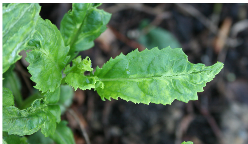
Figure 6. Twisted, chlorotic leaf of Veronica caused by CMV.