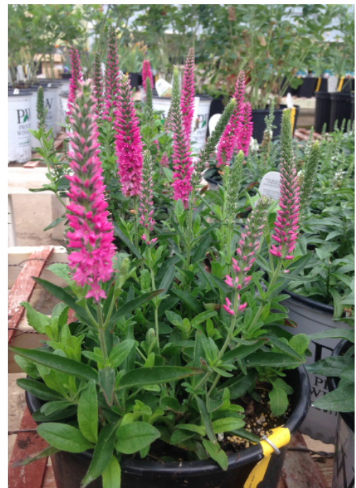
Figure 1. Veronica 'Pink Goblin' at retail garden center in Michigan.