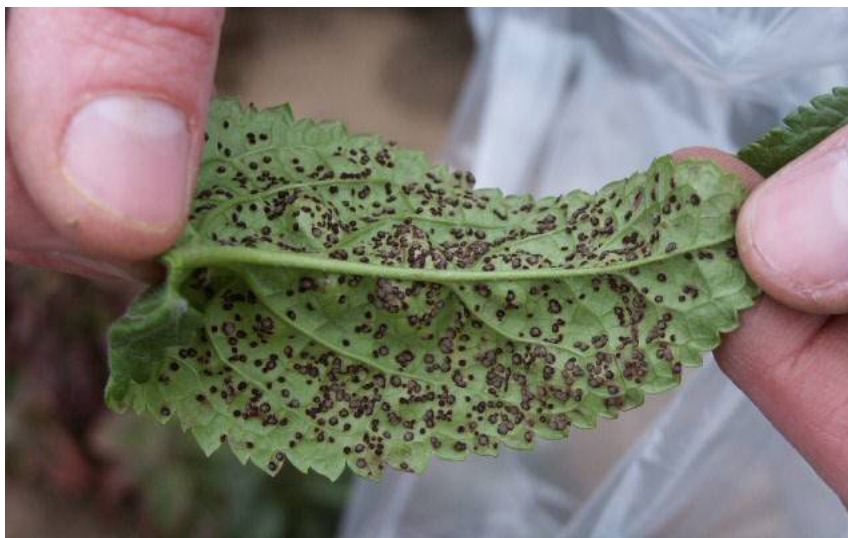
Figure 3. Red-brown rust pustules on the undersides of leaves from Veronica rust.

Where trade names, proprietary products, or specific equipment are listed, no discrimination is intended and no endorsement, guarantee or warranty is implied by the authors, universities or associations.